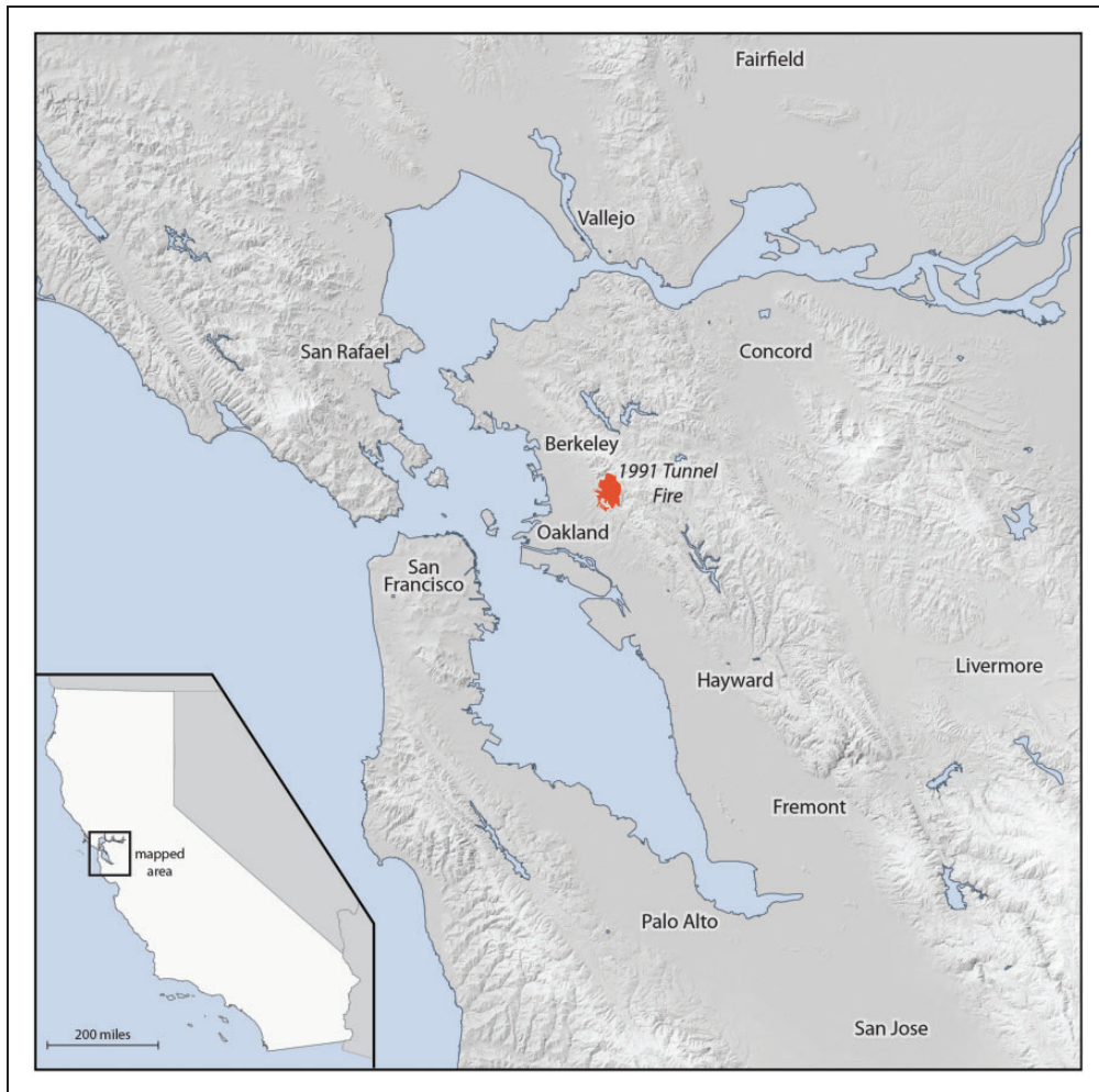
Figure 1. Location of the 1991 Oakland Hills Firestorm (also known as the Tunnel Fire), California, USA (map credit: Peter Anthamatten).

Paying closer attention to the different ways vulnerability and affluence interact reveals a recursive process that is significant in the context of building more disaster resilient communities. To better accommodate this recursive process in debates on how to coexist with wildfire at the interface between cities and beyond, we suggest a shift away from a place-based designated framework—the wildland–urban interface (WUI), which tends to focus on human–environment conflicts (Radeloff et al., 2005). Instead, we propose a process-based designated framework—the Affluence–Vulnerability Interface (AVI), which we use as a construct to contextualize risk and vulnerability within intersecting social characteristics and engrained norms. This broadens understandings of resident and community activities, needs and experiences in the context of complex disaster (or other destabilizing) events.