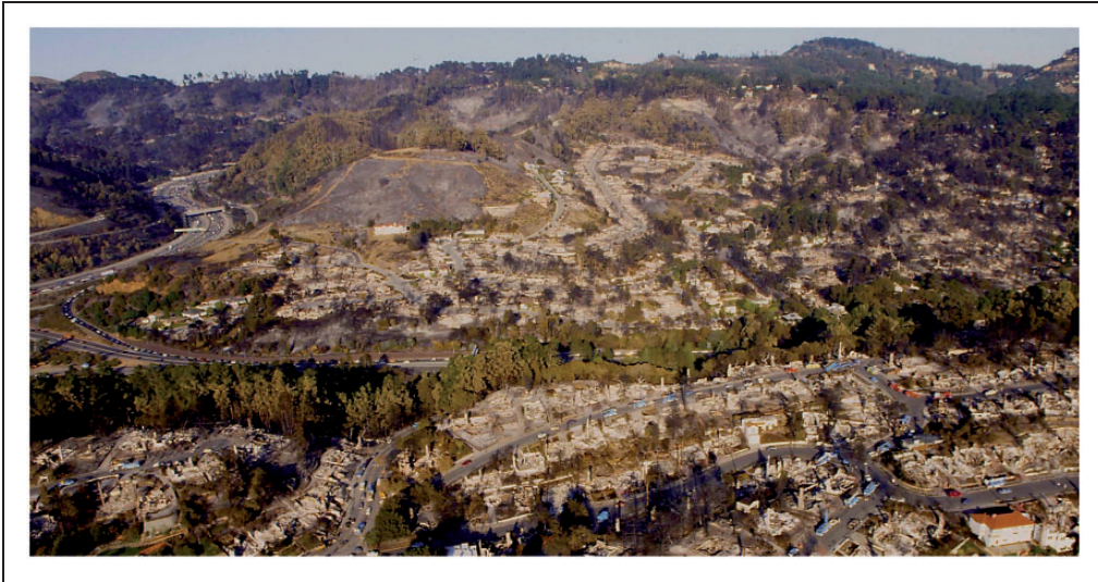
Figure 2. Looking east late October 1991: an aerial panorama captures a portion of the fire area. The blaze began near the upper left hand corner of the image and stretched out of view in all directions.

area and the qualitative research methods applied. We then turn to an examination of the diverse manifestations of risk and vulnerability revealed during in-depth interviews. This is followed by an analysis of collectivized risk and vulnerability reduction—a prominent theme in participants’ narratives. Finally, we conclude by considering if perceptions of risk and vulnerability help explain the willingness of many individuals and groups to transform and occupy high-risk landscapes, such as the Oakland Hills.