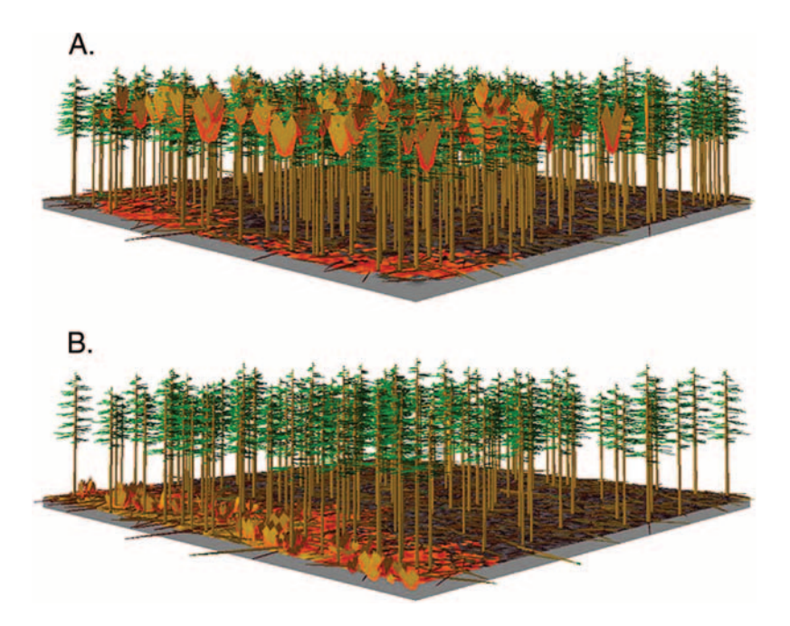
Figure 1. (A) Stand visualization system images of 150-year-old unthinned ponderosa pine stand (72% stand density index) that was predicted to exhibit stand-replacing fire behavior. This stand was neither resistant nor resilient to fire. (B) The same stand after thinning to \sim 30% stand density index the previous decade was predicted to exhibit surface fire behavior. In the short-term this stand will be resistant to wildfire. However, with the explicit recognition that future fires will occur, the long-term goal should be to build resilience, which could focus on retention of large, fire-adapted trees and increasing live tree spatial heterogeneity.

survive fire, if resilience is characterized as maintenance of mature aspen trees, aspen stands clearly lack resilience in a short-term time frame (Table 1). However, vegetative reproduction of aspen is typically prolific after fire, and within a few years vigorous aspen shoots will dominate the fire-affected area. Therefore, in the midterm, a mature aspen stand will dominate the site and in the context of this time frame, the aspen stand is highly resilient. In the very long absence of fire, aspen stands can be displaced by tolerant conifers, and in the context of this long-term time frame, aspen stand resilience is problematic if the goal is to maintain aspen.