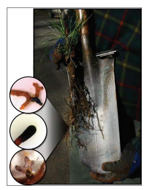
A closeup of root tips from a ponderosa pine seedling that have been colonized by ectomycorrhizal fungi. These beneficial fungi help the plant process nutrients. Researchers analyzed the ectomycorrhizal fungi that had colonized the seedling roots 4 months after the controlled burn. They did not find a difference in the number of fungal species among the high- and low-intensity burn and unburned plots.

With microscopy, taxa can be distinguished based on their features and colors. From a sampling of these root tips, they collected the fungi and ran a DNA analysis to identify the ectomycorrhizal taxa. In total, 66 taxa were identified, and there was no detected difference in the number of species between the high- and low-intensity burn and unburned plots.