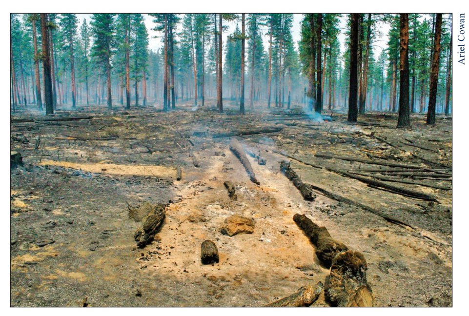
An experiment involving a controlled burn and "mega-logs" constructed to serve as proxies for large downed wood reveals new information about the effects of intense soil heating on soil fungi and subsequent pine regeneration. Chemical changes in the soil, triggered by intense heat, result in the distinctive reddish-tan color and mark the placement of the burned mega-log.

"The world depends on fungi, because they are major players in the cycling of materials and energy around the world."