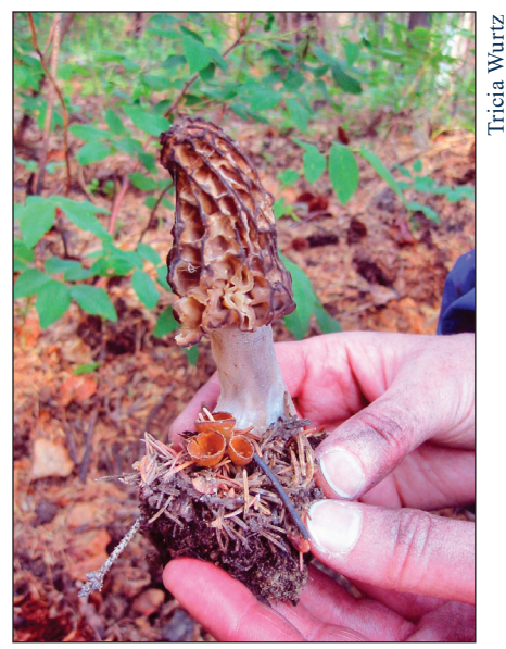
Morels are an example of fire-adapted fungi that will fruit after a wildfire. This edible genus is highly sought after by mushroom hunters.

explains. "Usually we're trying to correlate a study done in, say, Idaho or somewhere else in your region to your site, and it's nice to have research done on your own forest and immediate landscape to be able to reference. It's more powerful and strengthens your analysis."